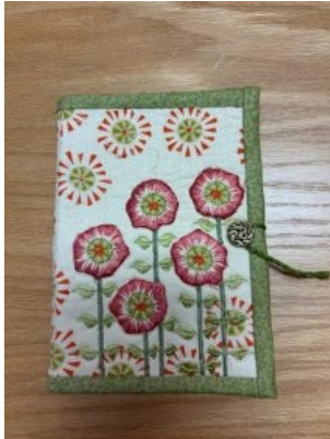
Nolita Wacaster – Needlebook