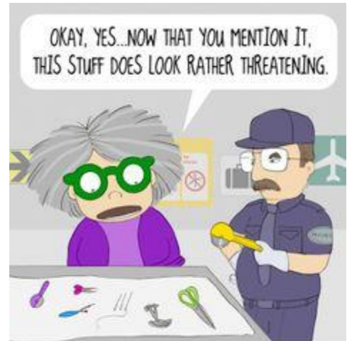
Mrs. Bobbins is forced to donate her quilting tools to airport security.